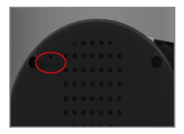
For Cube camera Reset button is at the back of the camera

Hold Reset button on camera till u here voice prompt from camera i.e "RESET SUCCESS"